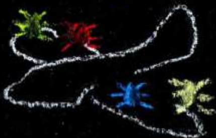
PHOTO was a Photinus firefly He gave off a yellow-green light